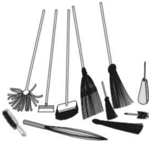
Figure 1.3. Various types of brushes

Brushes are available in various sizes and shapes and are made of different materials. Different brushes are used for specific jobs. Brushes with nylon or plastic bristles are used for cleaning carpets or furniture, round feather brushes are used to remove dusts, metal brushes are used to clean wire mesh in the windows