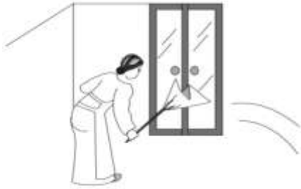
Figure 1.1 Dusting with a cloth

Sweeping: -When a sweeper or a brush is used to carry the dust laterally along the room, the process is known as sweeping. While sweeping any vertical surface as walls, you should remember to start from the top and sweep downwards. Similarly, for lateral sweeping as for floors, start from one end of the room and move to another, preferably a door, and carry the dust all along or collect in a dust pan. All the movable articles kept on the floor should be lifted, swept under, and kept back in place.