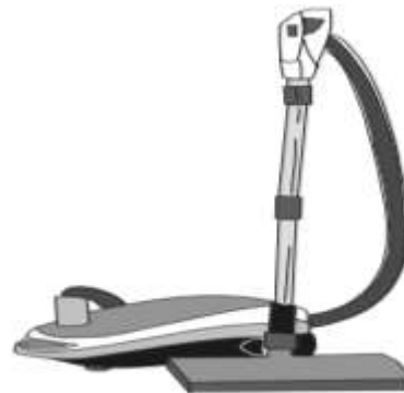
Figure 1.4. A vacuum cleaner

Vacuum cleaner- it works on electricity and has a fan. This sucks in the dirt and dust from the surfaces and stores it in a disposable bag inside. This bag should be emptied regularly.