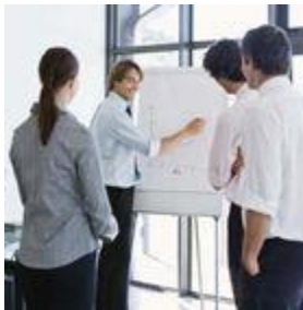
Figure 3: Displaying Outstanding Leadership

Many businesses have leaders, but not all businesses have outstanding leaders. An outstanding leader is one who can inspire others, and who leads by example. A successful leader is someone who is trusted by his team, and who delivers on his promises.