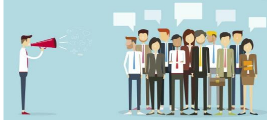
Figure 4: Communicating With a Large Team