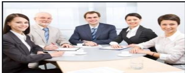
Figure 5: Effective Ways of Communication with a Team

Effectively communicating with a team means making each teammate feel included, engaged and valued. This means preparing well, listening reflectively, responding clearly and asking for feedback. Then you have to take that feedback and make good adjustments, remembering to always under-promise and over-deliver for your team.