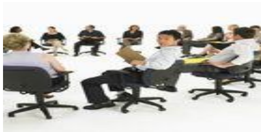
Figure 2: Effective Communications

A lack of clear communication can create obstacles for team success. Open communication and regular avenues for communication lead to long term cohesiveness within the team. Open communication also enables timely problem solving. Implementation of problem resolution strategies is more effective when there is clear communication among team members. Teams can use different methods to communicate.