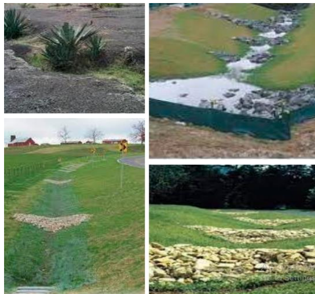
Figure 5.3. Check dam