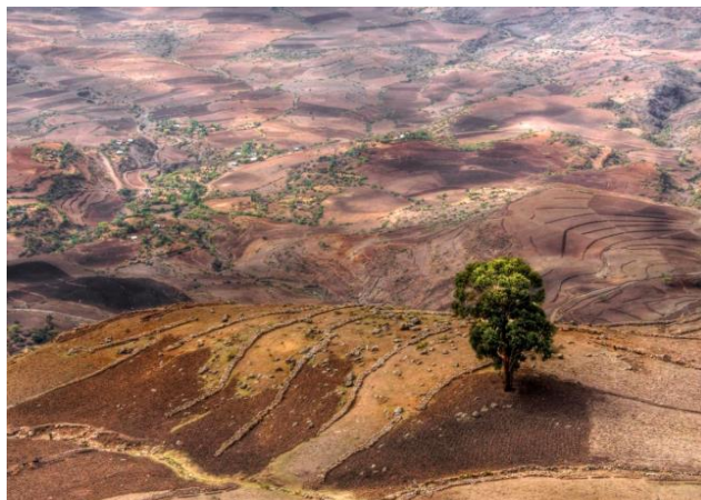
Figure 2.3 vegetation analysis