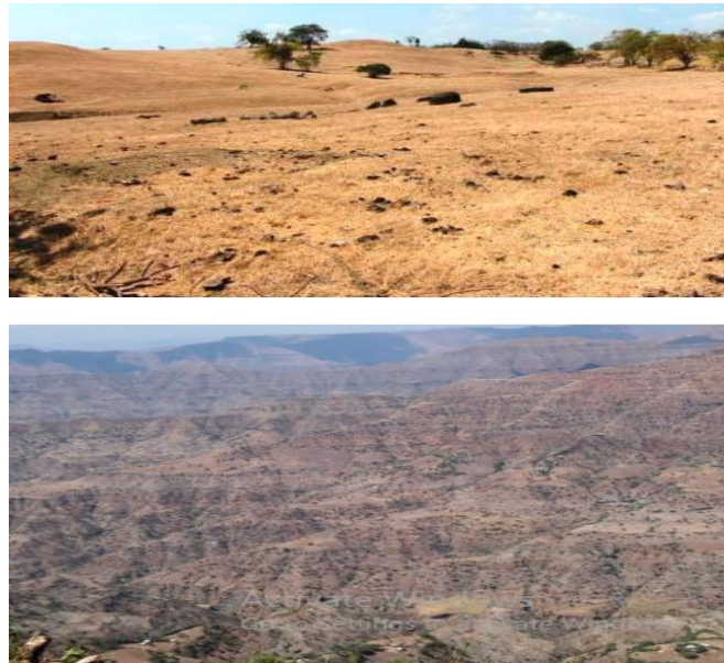
Figure 2.1. Degraded land

Restoring the ecological functionality of degraded and deforested landscapes is crucial while enhancing the well-being of people who coexist with these places. A means of regaining, improving, and maintaining are vital ecological and social functions, in the long-term leading to more resilient and sustainable landscapes. Restoring is a whole landscape to meet present and future needs and to offer multiple benefits and land uses over time. The practice of renewing and restoring degraded, damaged or destroyed ecosystems and habitats by human intervention.