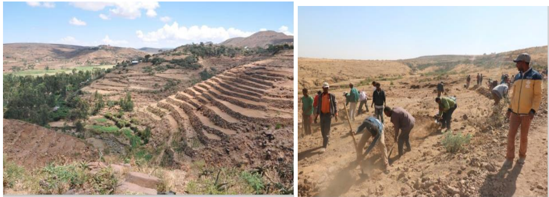
Figure 2.2 restoration program