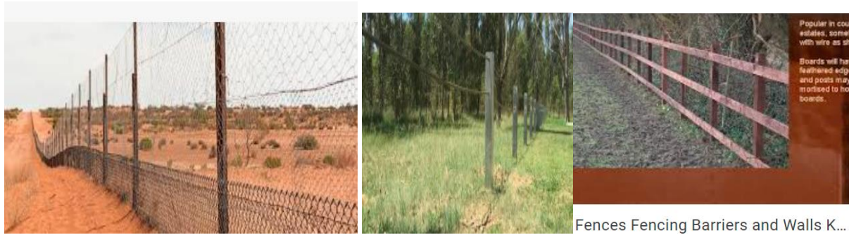
Figure 4.3. Fences and barriers

people, vehicles, and equipment, to structural natural area or other prohibited areas of the restoration site.