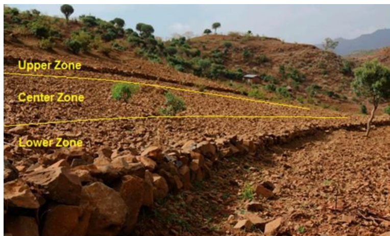
Figure 5.2. stone bunds