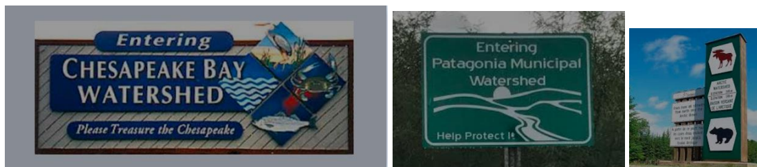
Figure 4.2 protective signs

Protective signs are symbols to be used during an armed conflict to mark persons and objects under the protection of various treaties. One method that is being used to make the public aware of the sources of their water is the use of signs that mark the watershed boundaries and label the rivers and reservoirs within the watershed.