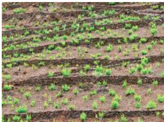
Figure 5.4. Hillside terraces